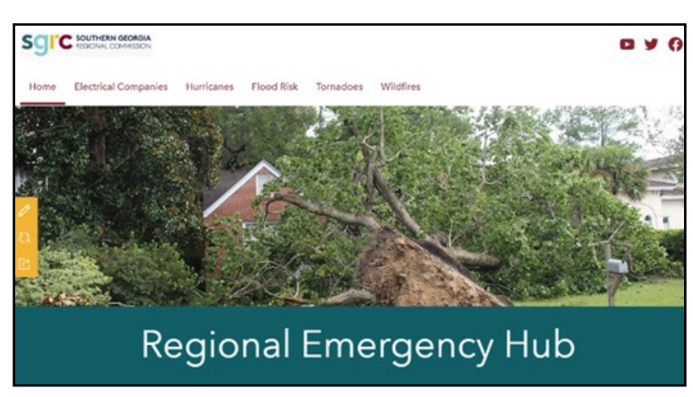
Regional Emergency Hub home page

November. Flooding and wildfires can happen at any time. The SGRC-GIS Division has created a Regional Emergency Hub, a "one-stop shop" for information on emergency preparedness, weather alerts, videos, maps, and dashboards sharing evacuation routes, power outages, and many other essential tools. The Regional Emergency Hub is accessible from any internet device by visiting https://www.sgrcmaps.com/reh.