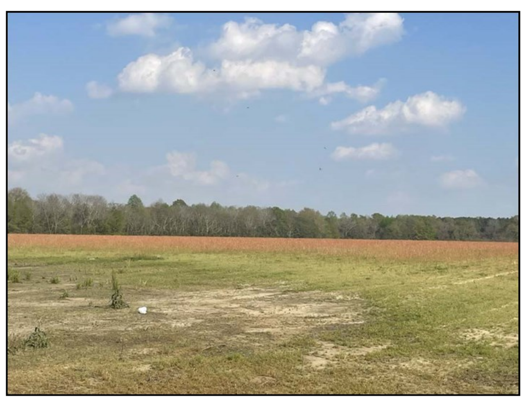
A Second View of the Future Home of Peachtree Business Park

Georgia Bikes and Southern Georgia Regional Commission have TWO training opportunities coming up! Law enforcement officers are welcome to attend the sessions planned in August at the Valdosta Police Department and Waycross Police for two POST-credited bicycle and pedestrian safety workshops. See the registration links below for more info!