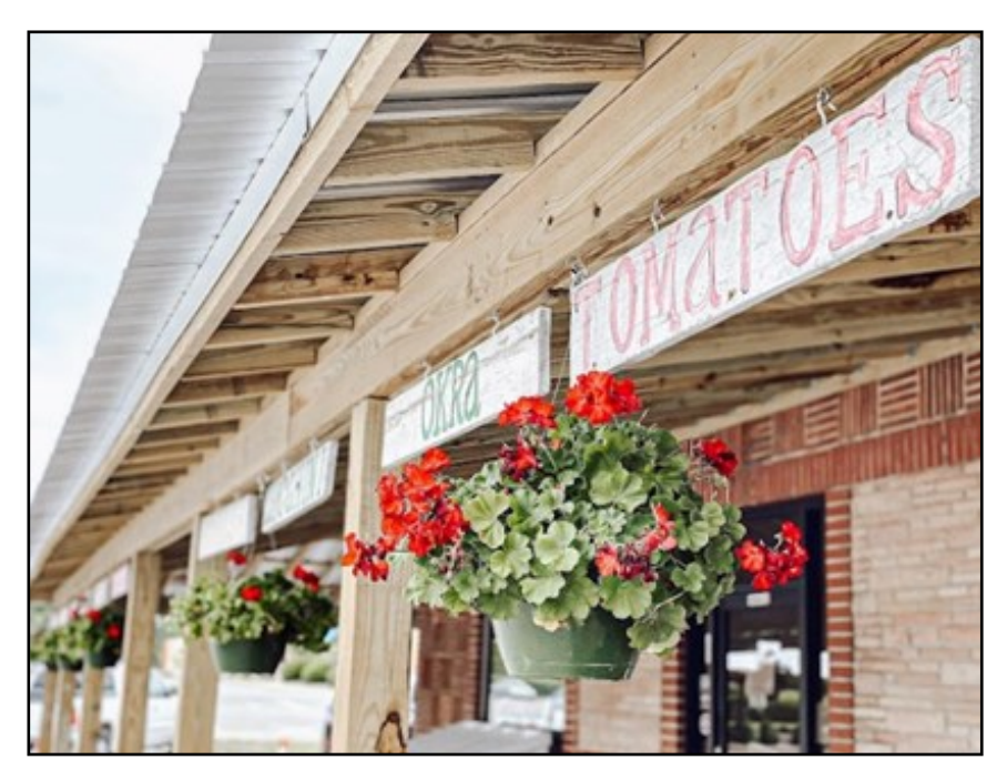
Ganas Peacan Storefront in Waycross

ber 2017 to broaden the scope of its operations. Initially, the main line of the business was to buy and sell nuts grown by Garrett and other local farmers in a setting that would allow consumers to support local farmers. Over time, the business has evolved into housing its line of pecan products, including but not limited to raw, candied, and flavored, amongst many other pecan-infused products. Specialty items such as jams, jellies, jarred fruits/pickled goods, sauces, cooking oils, and various other items fill the store shelves to offer a one-stop shop for all things Southern. Growth has